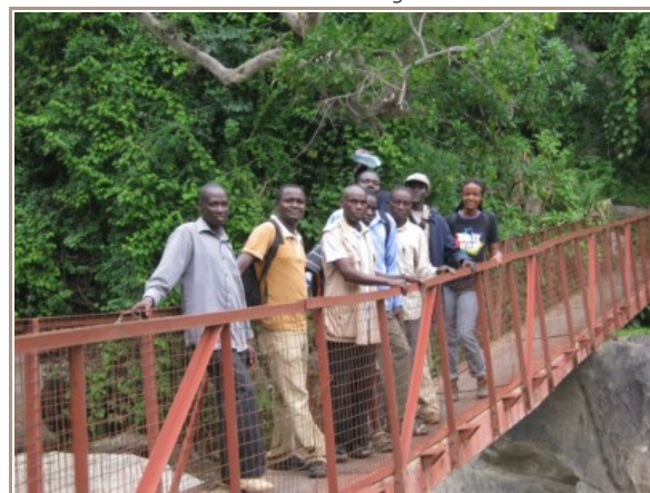
Figure 4. The Marakwet research team.

Working independently for several months at a time, the team utilises the rapidly improving mobile internet network to send results to UK-based project leaders where they are processed and incorporated into the GIS archive. Mobile internet is also used to plan research agendas (via email/Skype), producing a fluid adaptive research strategy. The team are supported financially and instantly via the M-PESA mobile banking system. Over the coming years the project will develop its use of mobile technologies, trialling smartphones and tablets for data collection, making use of integrated GPS, camera, dictaphone and note-taking features. Project data will be synchronised across devices via the internet and/or a local area network allowing for flexible working and the seamless collection and collation of data.