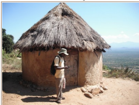
Figure 3. Marakwet team member collecting household data points using GPS.